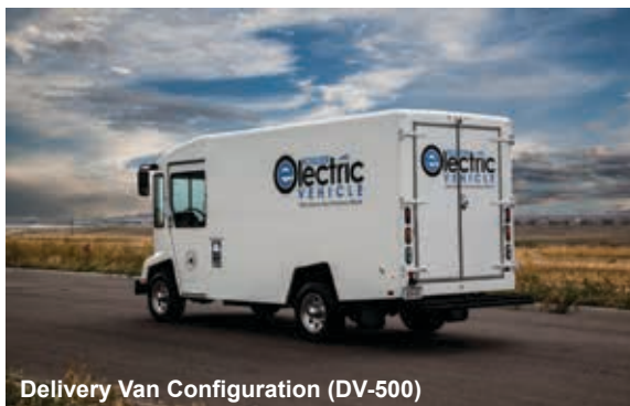
Delivery Van Configuration (DV-500)