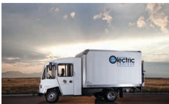
Box Truck Configuration (DV-500BX)