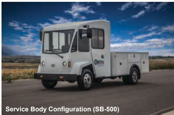
Service Body Configuration (SB-500)